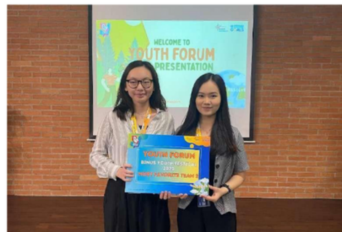
➤ Binus Youth Festival 2023 (Evolve To Resolve)